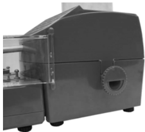
Turn the drain spout ½ turn to open the spout